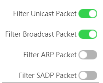
Figure 3-4 Data Forwarding Settings