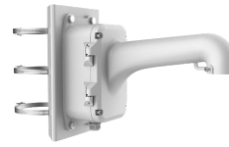
DS-1604ZJ-Box-Pole Vertical Pole Mount with Junction Box