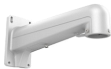
DS-1602ZJ Wall Mount