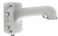
DS-1604ZJ Wall Mount