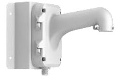
DS-1604ZJ-Corner Corner Mount