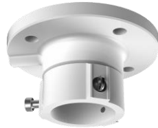
DS-1663ZJ Ceiling Mount