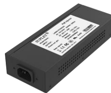
LAS60-57CN-RJ45 Hi-PoE midspan