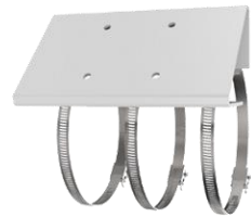
DS-1673ZJ Horizontal Pole Mount