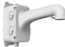
DS-1604ZJ-Box Wall Mount with Junction Box