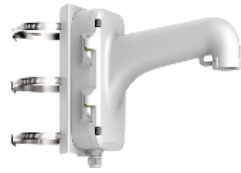
DS-1604ZJ-pole Vertical Pole Mount