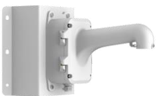
DS-1604ZJ-Box-Corner Wall Mount with Junction Box