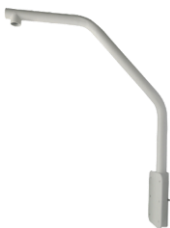
DS-1660ZJ Parapet Wall Mount