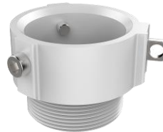
DS-1681ZJ Installation Adapter