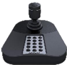
DS-1005KI USB Joy-stick