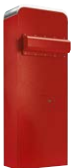
1 LIMIT 800 24V